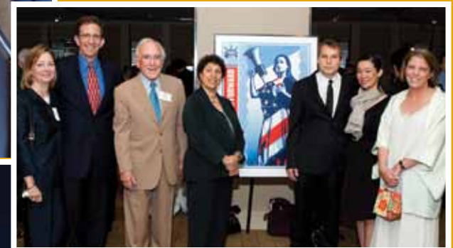
Just a few of our recent past Bill of Rights Dinner speakers and entertainers include (clockwise from top left): Sen. Ted Kennedy, humorists Lewis Black and Baratunde Thurston, artist Shepard Fairey with ACLU leaders, Nation editor Katrina vanden Heuvel, activist Kerry Kennedy, comedian Kate Clinton and (center) television commentator Keith Olbermann.