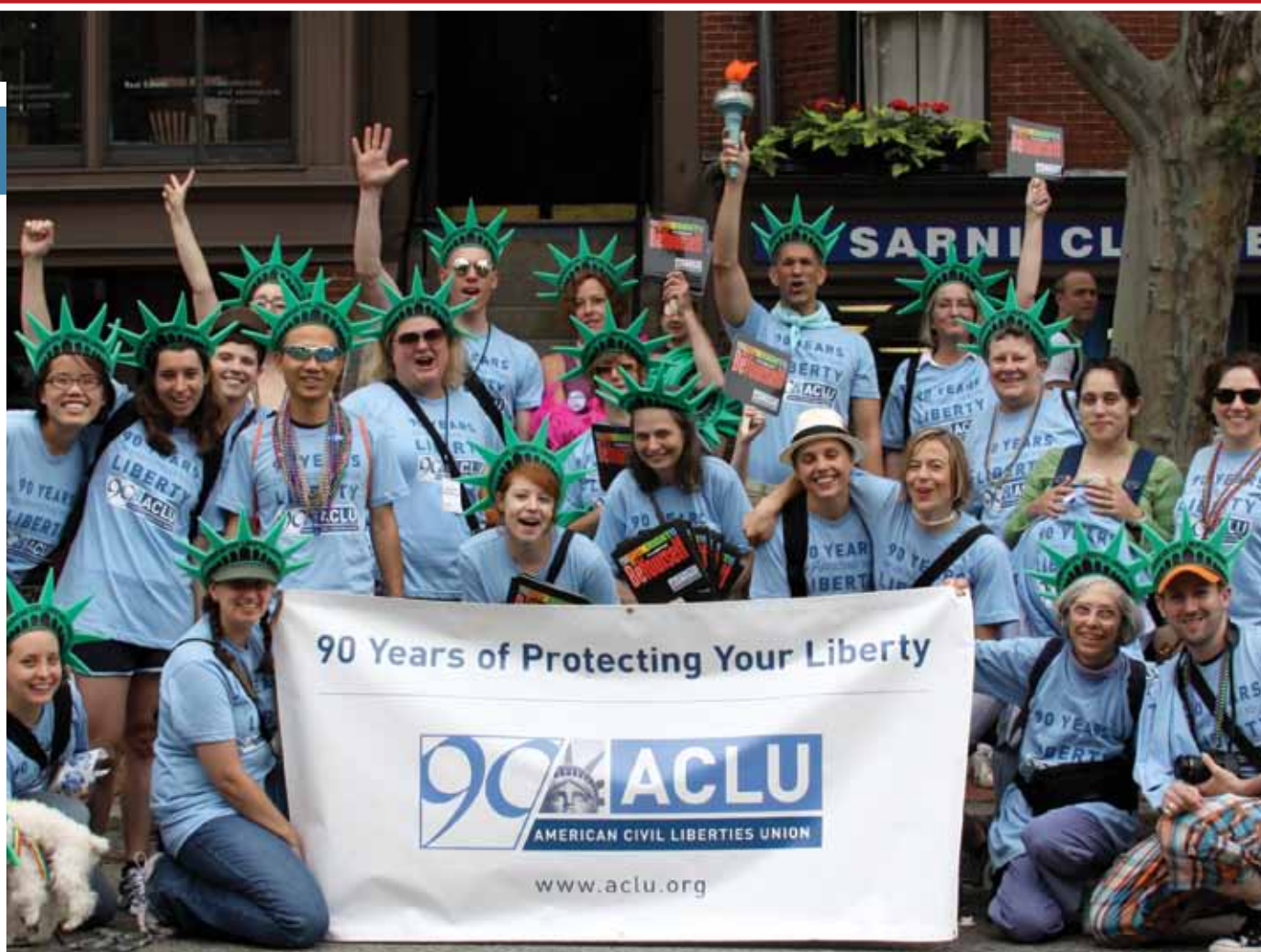
In 2010, ACLU supporters marked the 40 th anniversary of Boston Pride, and the 90 th anniversary of the ACLU. March with the ACLU in Boston Pride on Saturday, June 11, 2011—go to aclum.org/events.

Here in Massachusetts, we continue to fight to protect marriage equality, and remain committed to passing legislation to outlaw discrimination on the basis of gender identity. Get involved at aclum.org/action .